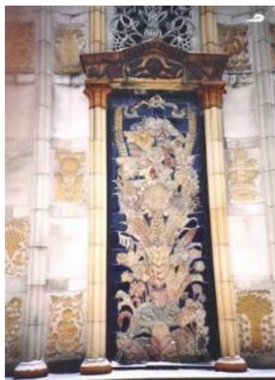
Detail from the building above