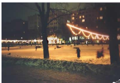
People skating on the ice of the pond in the 'Chistye Prudy' (=clean ponds) park, situated in Central Moscow

tion rate of AIDS that approaches epidemic proportions. Other contagious diseases, such as tuberculosis and hepatitis B and C, are also progressing. Alcoholism, suicide and emigration are furthermore having a severe impact on population development. Russia's population has decreased sharply, due to the increase in the average mortality age, and infant mortality, and the decrease in births. 'Who wants to give birth nowadays?' a woman on the train asked me. 'What for? To create beggars?'