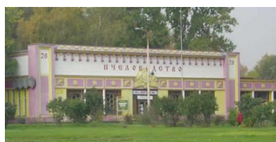
Pavilion 28 – originally presenting the achievements and new developments of bee-keeping

should admire the technical achievements the socialist system was capable to produce as it had eliminated all destructive competition, freed the creative spirits of man which in capitalism are suppressed and reached a level of co-operation unseen so far in these lands.