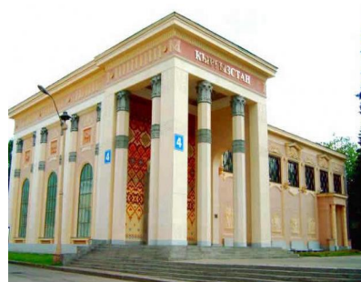
The pavilion representing the achievements of Kirgisia's economy.

During World War II, and for nine more years the exhibition park was closed. After thorough reconstruction – the area was enlarged to 207 hectares, and the amount of buildings rose to 383 – it was reopened in 1954. The new main entrance was right beside the underground station that leads to the exhibition. Finally in 1958 it was decided to unite the agricultural, industrial and construction exhibitions in this area and the new united exhibition park was renamed VDNKh. Already before that certain pavilions had been built or changed in order to represent the economic developments in the various republics/entities united in Soviet Union, such as Georgia, Aserbaidzhan, or the Baltic States.