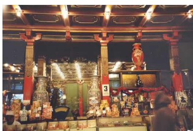
A tea shop in Central Moscow

Russia you can't grasp/comprehend with your mind you can't measure it with the Arshin (a measure unit from old times) it has an unique form, you can only believe in it.