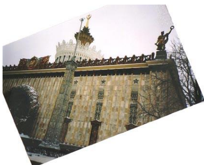
Another fine specimen of Stalin-era classicism – designation unknown.

After Soviet Union was gone harsh times started for the exposition grounds. No one was in need any more to advertise Soviet progress. To the new politicians devoted to the promotion of Market Economy VDNKh became a both financial and ideological burden. First, its maintainance cost money without bringing profit. Second, it was a uncomfortable witness of times gone by, a huge monument that proved that the Soviet system did have its advantages and did produce acknowledgeable results.