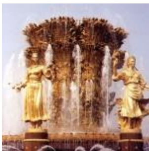
... and a detail from it