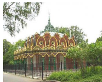
A building originally dedicated to the exhibition of furniture and interior decoration, as well as family-house building.