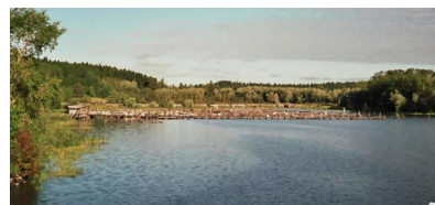
The landing stage for the boats of Sortavala:

Sortavala belonged to Finland till the 'Winter War' of 1939. The Winter War, aimed at recapturing Finland on the eve of World War II to a certain extent was a disaster for the Soviet Union as it lost far more soldiers than the Finns and was not able to conquer Finland. Still, as a result Finland in spring of 1940 had to cede Eastern Karelia, including Sortavala that had been bombed heavily in the winter of 1939. Most of its inhabitants left then and went to the remaining parts of Finland.