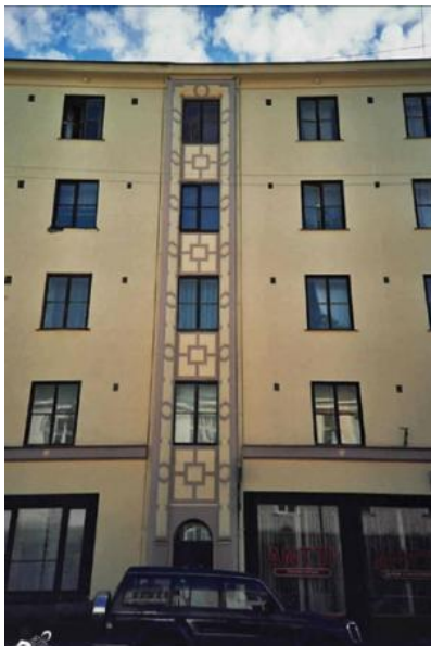
Another nice house about which I couldn't find out anything!