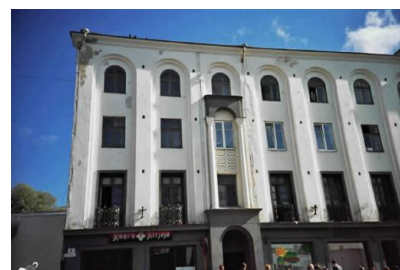
A building that has to do something with the church behind it,

Only a small part of Karelia is in Finland, in the Southeast, with the towns of Joensuu and Lappeenranta. The larger part of Karelia is in Russia.