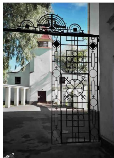
the church of St. John the Baptist

which is an orthodox church though it doesn't look orthodox at all. Either it was originally built for some other religion, or the Finnish orthodox churches differ considerably from the Russian ones.