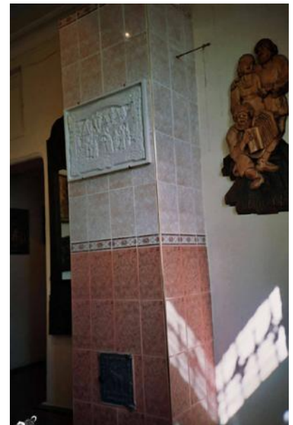
A tiled stove in a museum in Sortavala

In the 'Continuation War' of 1941 Finland sided with Germany and invaded Soviet Union, allegedly to recuperate the lost territories of Karelia. But then it pressed on and even took Petrozavodsk which had never been Finnish. The Finnish invasion proved a serious threat to Soviet Union, and endangered the anyhow difficult supply of besieged Leningrad.