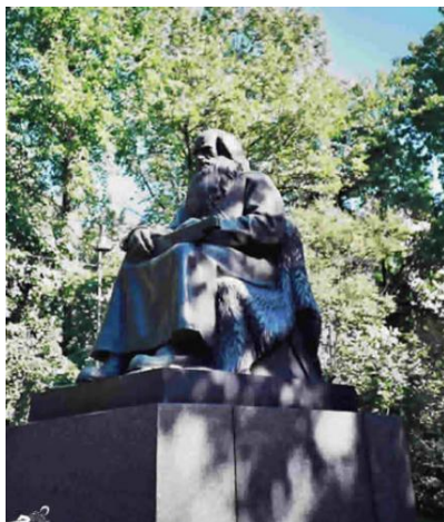
Statue in honour of the bards who cultivated and passed on the popular myths of the Finn people.

Well, it wasn't really made here, as the Kalevala – the book of legends of the Finn people – is the result of the collection of popular tales that were told/sung in the villages by the bards, who accompanied it with a kind of cithera, the kantele .